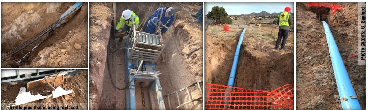
Brittle pipe that is being replaced